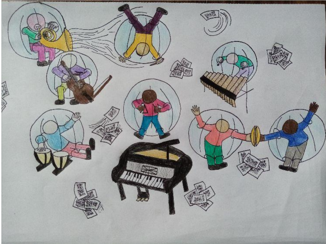
Maebh Dimond, age 12, "Bubble Orchestra"

Students from Hanze University of applied Sciences (Groningen/Netherlands) were looking into communication strategies and communication practices in EOFed. They are ready now and they sent us their extensive reports.